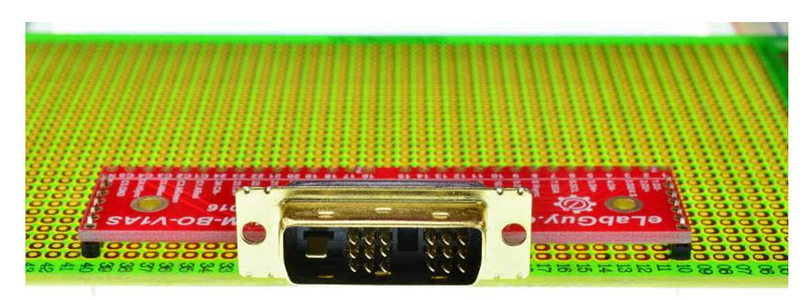
Figure 4: Solid Mounting on prototype PCB