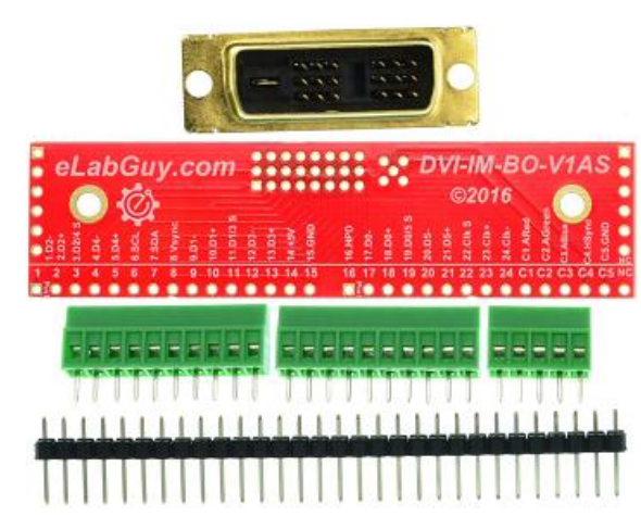
Figure 1: Parts inside the kit (Note: the module is not assembled, user can decide which connector to use on the module.)