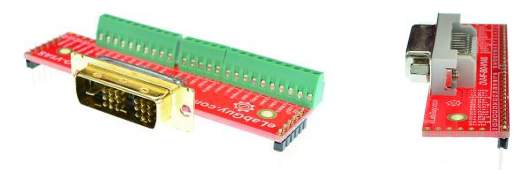
Figure 3: DVI-DSM-BO-V1AS various connections